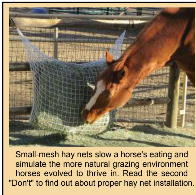
Small-mesh hay nets slow a horse's eating and simulate the more natural grazing environment horses evolved to thrive in. Read the second "Don't" to find out about proper hay net installation.

Enter slow-feed hay nets, also known as small-mesh nets. While a traditional hay net has mesh large enough for a horse to stick his muzzle in and get a big mouthful, slow-feed nets have