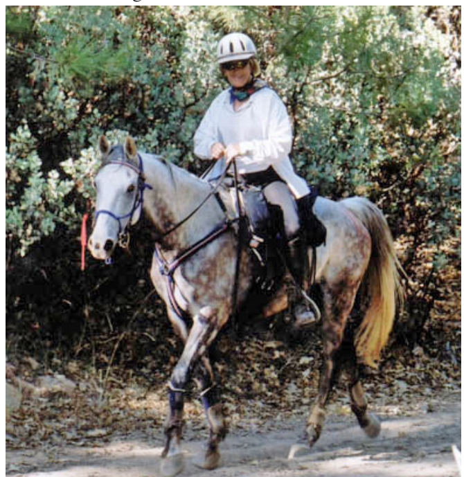
Continued on Page 11

Feel free to contact me regarding the issues that are facing NATRC at this time. I would like to see others in NATRC come forward and help make this organization what it can be. I can be reached at 408/779-4722 or at sleeeker@garlic.com .